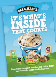
Countertop Strut Card