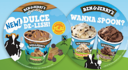
Wobblers (Available for NPD & Core)