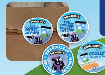
Post purchase appraisal with bag stickers

Moving dynamic content can be more engaging for customers increasing your chance of sale.