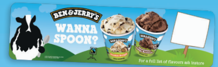
Menu Board Extender