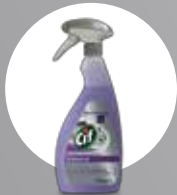
CIF 2IN1 KITCHEN CLEANER DISINFECTANT