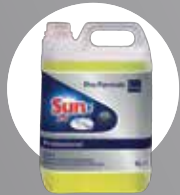
SUN 2IN1 DISHWASHER DETERGENT & RINSE AID